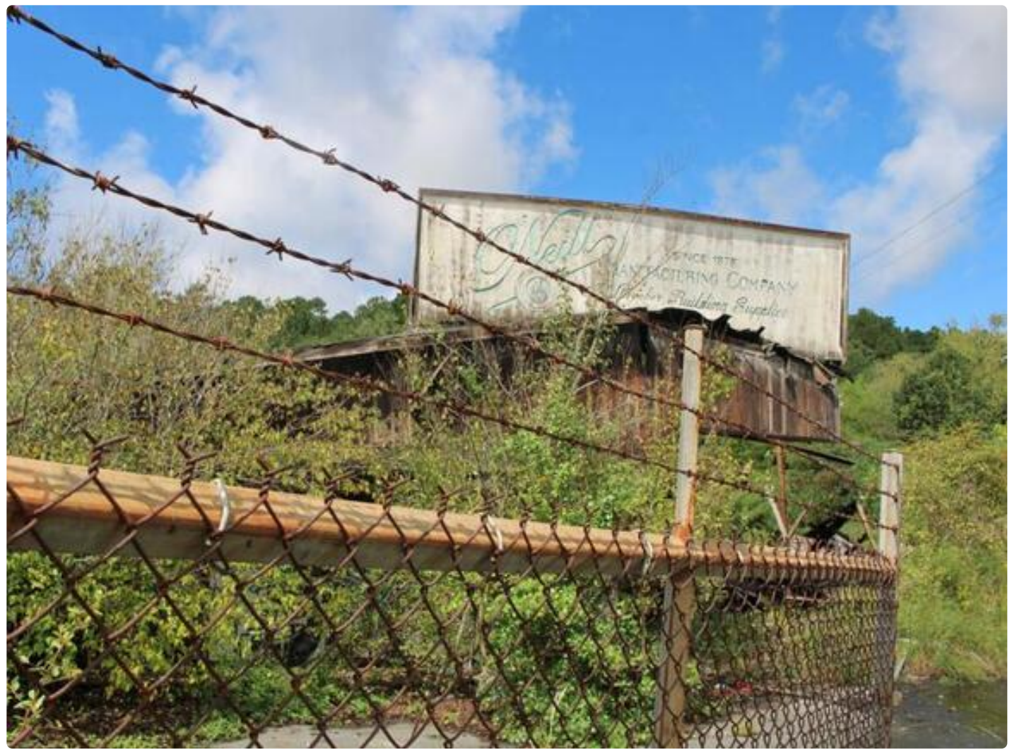
One of the county's most notable brownfield sites is the former O'Neill Manufacturing plant, a 7-acre tract off Anderson Street in North Rome.